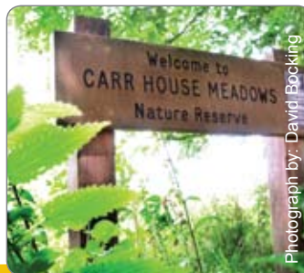
Carr House Meadows