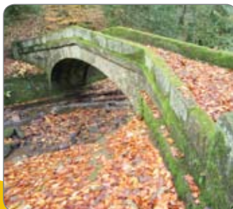
Pack Horse Bridge, Glen Howe